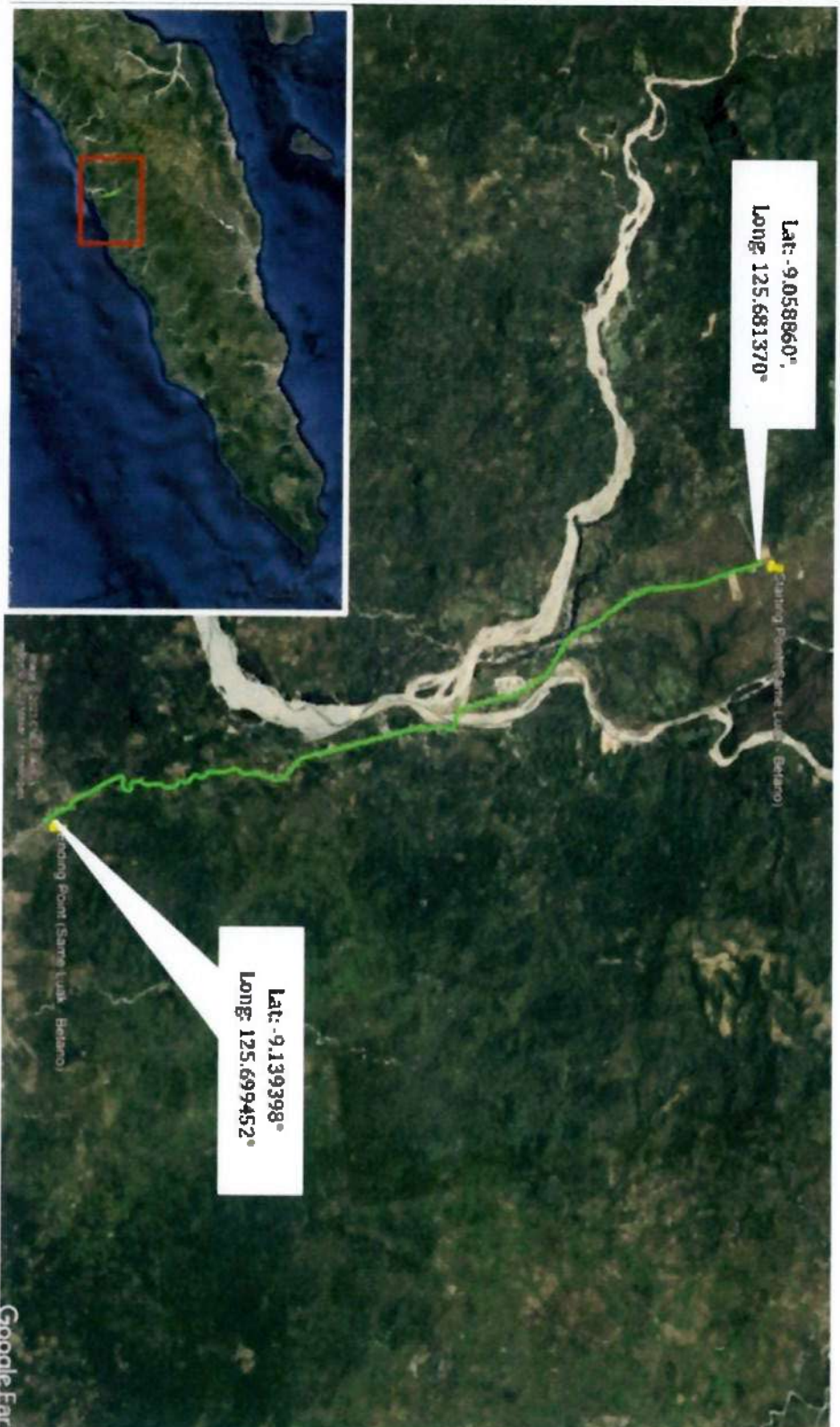
Figure 2-4: Location of Same Luak – Betano as per TOR (Google Earth, 2023)